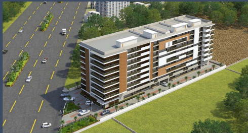
PRIME HILL CREST @ VADDESWARAM