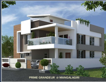
PRIME GRANDEUR @ MANGALAGIRI

Apart from Real Estate and Construction, The PRIME Group has interests in manufacturing industry as well. The group is successfully running an Autoclaved Aerated Concrete (AAC) Block manufacturing, as well as UPVC doors and windows assembling facility near Vijayawada. The AAC Blocks, UPVC doors and windows are marketed under PRIME brand. For more information about these products visit us at www.primeaac.com and www.primeupvc.com