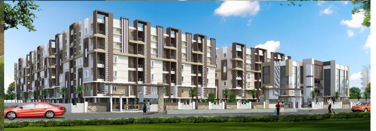
PRIME GALAXY @ MANGALAGIRI