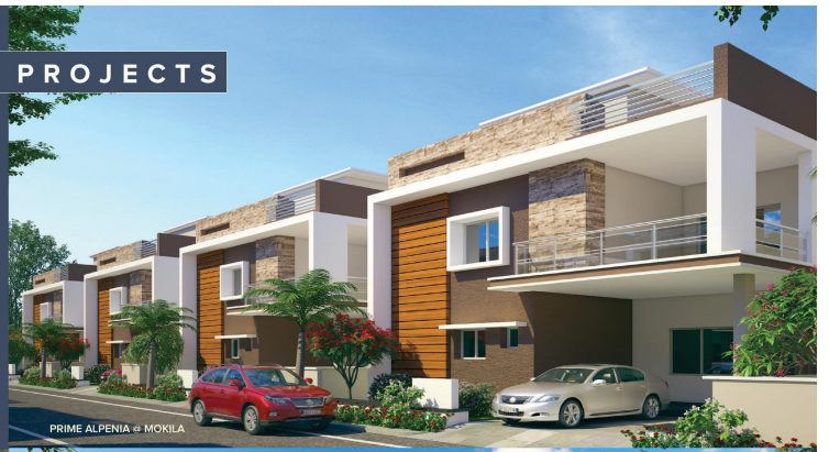
PRIME ALPENIA @ MOKILA